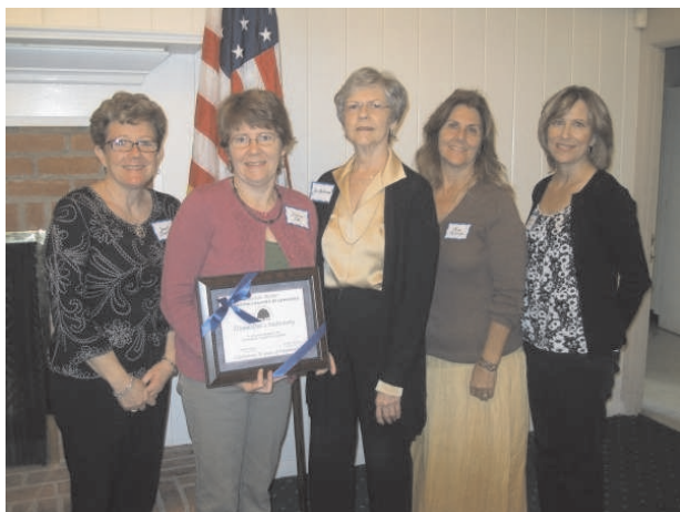
The Staff of Diana Dee's shared breakfast together and celebrated their Chamber membership.

A small group of members came together to celebrate the milestones of many members. They enjoyed the opportunity to network with one another over a leisurely breakfast.