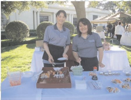
The ladies from Yoshida were serving up sushi with a smile! Always a crowd favorite!