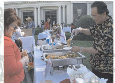
Fu-Shing treated guests to a delicious Chow Mein and Kung Pao dish..