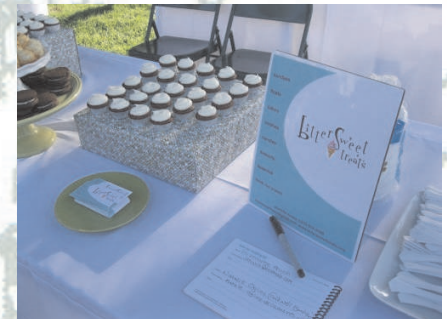
A beautiful display from Bittersweet Treats