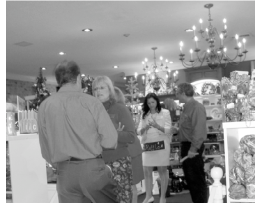
A Stitch in Time/Hodge Podge was ready for holiday shoppers the evening the Chamber met to mix, shop and dine.