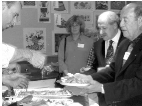
One of the food stations featured holiday dips and breads available at Hodge Podge.