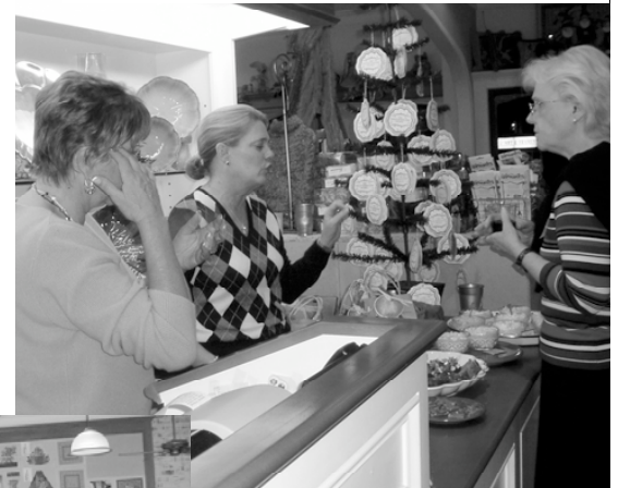
One of the food stations featured holiday dips and breads available at Hodge Podge.