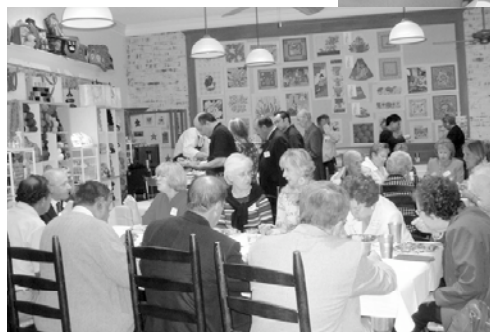
Chamber members and guests feasted on fine Italian fare from Bella Italia and chose from lasagne, sausage, salad and garlic bread.